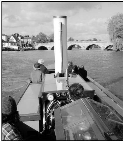
Consuta approaching Henley Bridge, November

Consuta was restored to working condition during 2001, and has been operational each year since then.